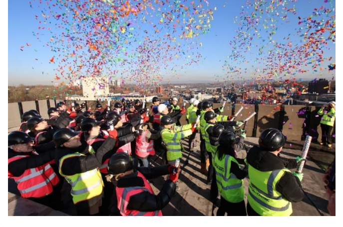
Topping out ceremony at Weir Mill, November 2023